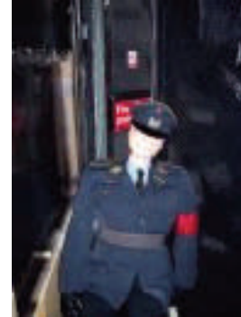
Your editor after one of the aforementioned drinking sessions.

undiscovered talent out there, so share with us the 'things what you write.'